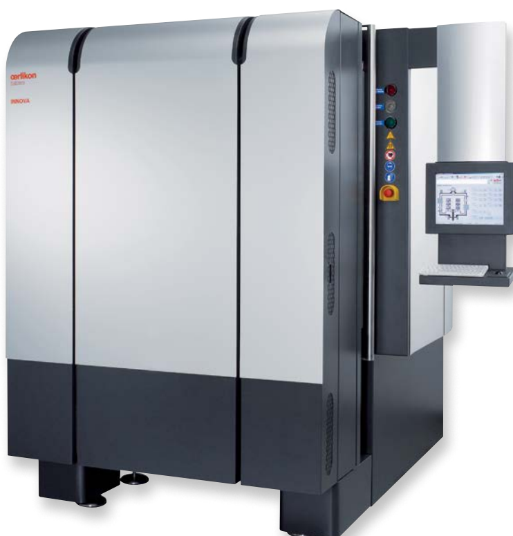
Oerlikon Balzers INNOVA PVD coating unit 500kg capacity