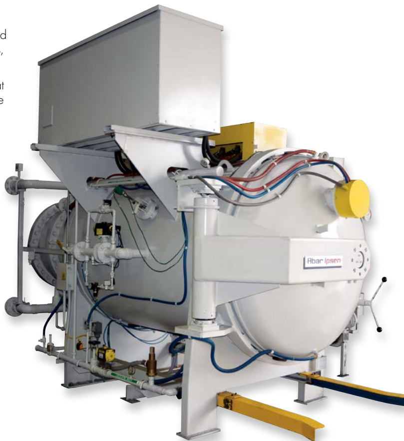
12 bar TurboTreater® vacuum furnace 1 tonne capacity Furnace Capacity 600mm x 600mm x 1000mm

Our experienced technicians accurately record all processing parameters and monitor all processing variables. They will work directly with your material, design or manufacturing engineers to determine the optimum processing methods to meet your requirements.