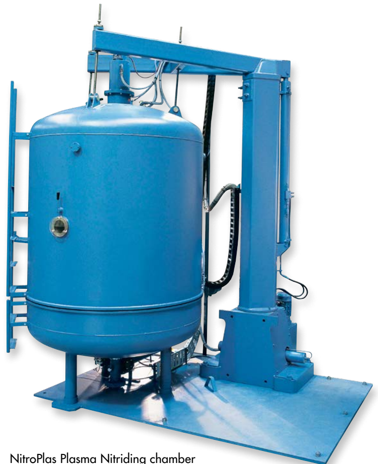
NitroPlas Plasma Nitriding chamber 5 tonne capacity Chamber Capacity 1.2m diameter x 1.5m high